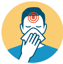
CONGESTION OR RUNNY NOSE