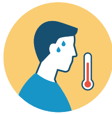
FEVER 100.4* *or school board policy if threshold is lower