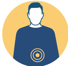
NAUSEA OR VOMITING