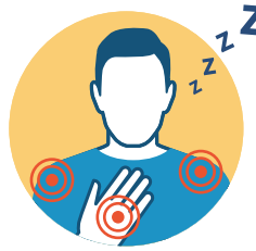
MUSCLE PAIN AND FATIGUE