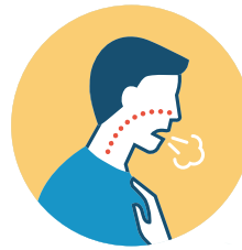
SHORTNESS OF BREATH OR DIFFICULTY BREATHING