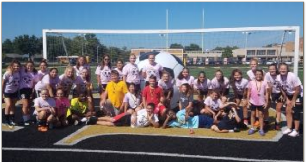
Griffith Girls Soccer Team and Best Buddies participating in their 2nd Annual Soccer Match!

2 – The school must participate in at least one activity designed around Whole School Engagement that promotes and encourages awareness, respect and inclusion of persons with intellectual disabilities. – Griffith High School has participated in the following: